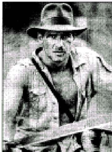
DISCOVERY: Harrison Ford in Raiders Of The Lost Ark .

His hunt continues for surveying references large or small, but so far he has uncovered no fewer than 18